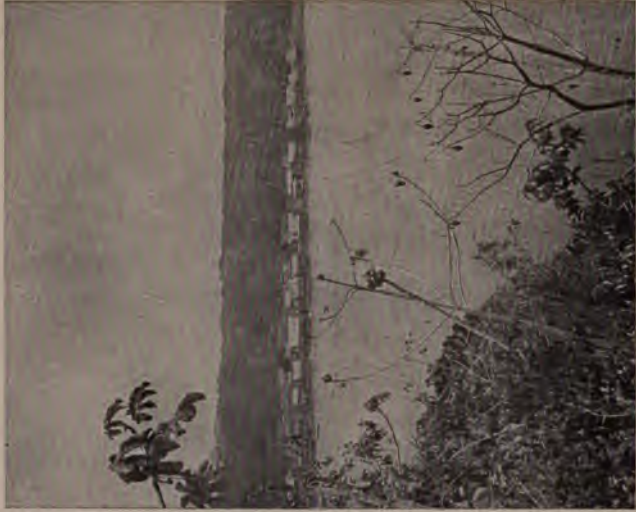
The village from the fort